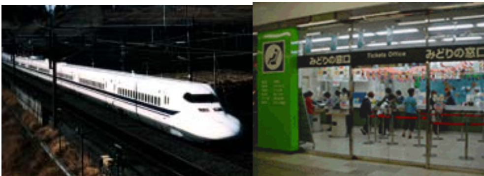
Shinkansen and the JR "Midori-no-madoguchi"

For long distance train travels, such as to Kyoto, you would use the JR trains, in particular, the famed "Shinkansen" or "Bullet Train" Superexpress in English. It travels at maximum 300km/hour. There are three types of Shinkansen Eastbound from Tokyo to Hakata via Kyoto, Osaka, etc., Nozomi (2 hours to Kyoto), Hikari (2.5 hours), and Kodama (4 hours). Nozomi is slightly more expensive but faster. There are open and reserved seats for Hikari and Kodama (All seats on Nozomi are reservation only), but it are recommended that you do make a reservation. First class (the Green Car) is about 30-50% more expensive. There are 3-4 Nozomis per hour, and more Hikari's. See http://www.asahi-net.or.jp/~ev7a-ootk/time/etime_01.htm for a timetable in English. Note that Northbound Shinkansen has different name and types of cars.