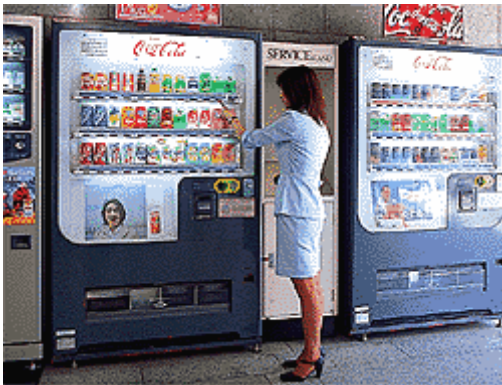
A typical Tokyo Scenery---rows of vending machines

Beverage on menu in restaurants tends to be generally expensive, however, compared to what you can get in vending machines---they could typically cost 200-500 yens, as opposed to 100-150 yens. If you want to keep you costs low the advice is to stick to free beverage (tea or water) in restaurants. Don' worry; as mentioned earlier there must be more vending machines then people here in Tokyo, and there are numerous convenience stores to supplement them.